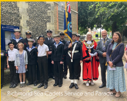
Richmond Sea Cadets Service and Parade