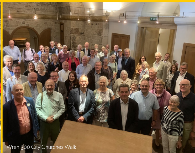
Wren 300 City Churches Walk