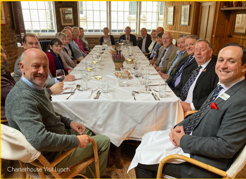
Charterhouse Visit Lunch