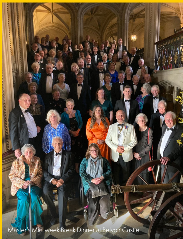
Master's Mid-week Break Dinner at Belvoir Castle