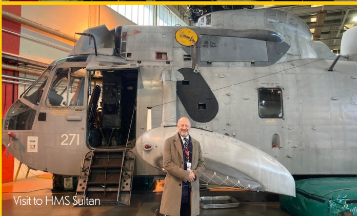
Visit to HMS Sultan