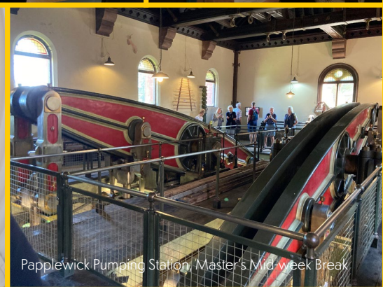
Papplewick Pumping Station, Master's Mid-week Break