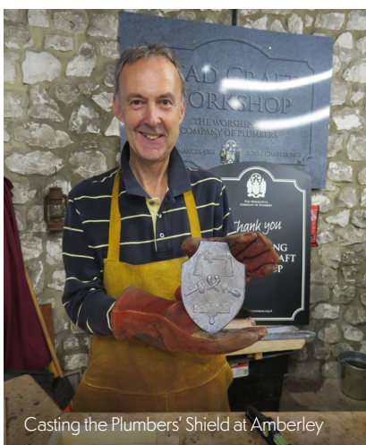
Casting the Plumbers' Shield at Amberley

The Company has had a busy year — the tiresomeness of Covid and lockdown well behind us — with the development of a new scheme for young plumbers, the digitising of more records in the Company Office and developing an easier path for new joiners (now purely on-line) while a five-yearly Strategic Review Day focussed our attention on the future and priorities for the Company over the next few years.