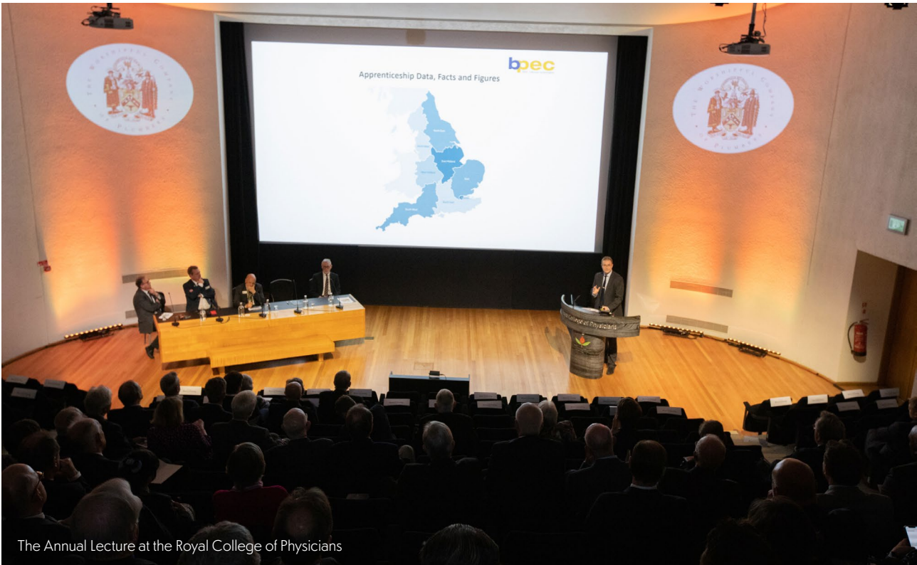
The Annual Lecture at the Royal College of Physicians