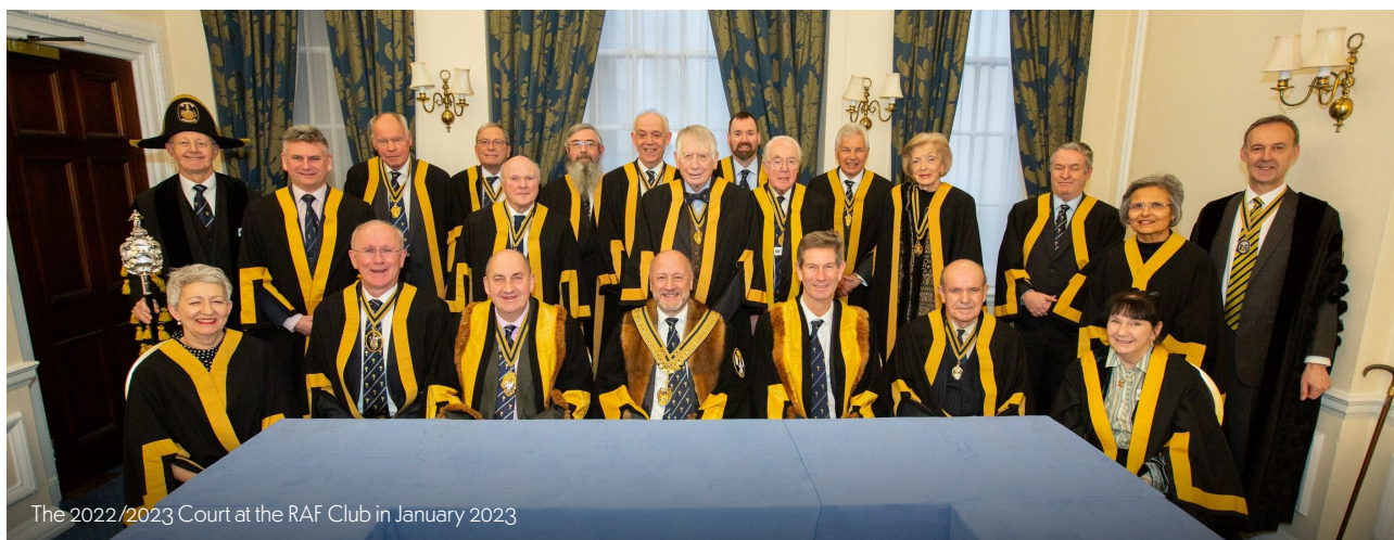
The 2022/2023 Court at the RAF Club in January 2023