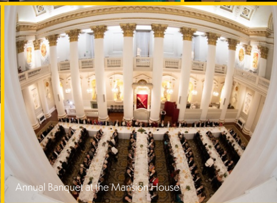
Annual Banquet at the Mansion House