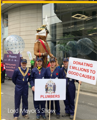
Lord Mayor's Show