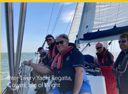
Inter-Livery Yacht Regatta, Cowes, Isle of Wight