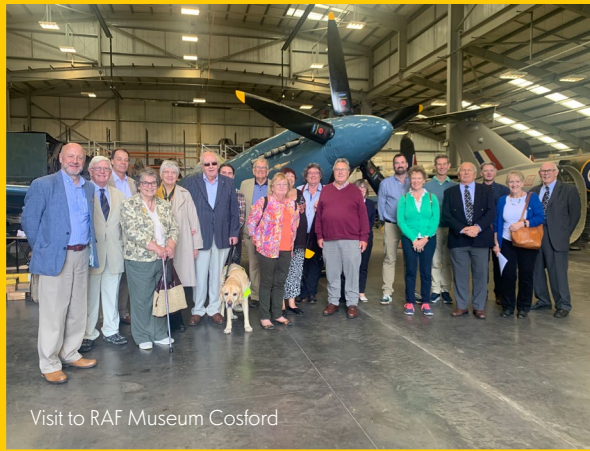
Visit to RAF Museum Cosford