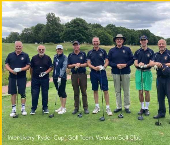
Inter-Livery "Ryder Cup" Golf Team, Verulam Golf Club