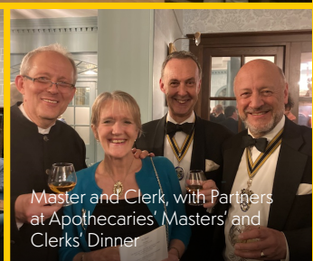
Master and Clerk, with Partners at Apothecaries' Masters' and Clerks' Dinner