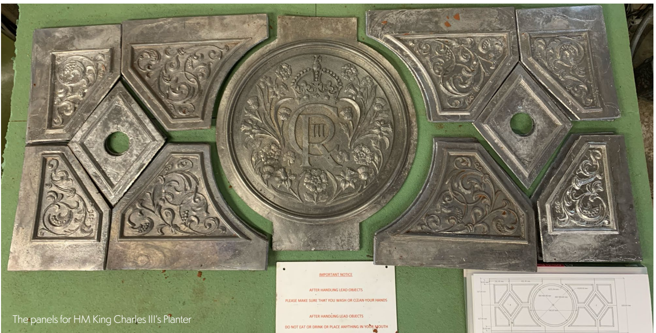
The panels for HM King Charles III's Planter

IMPORTANT NOTICE AFTER HANDLING LEAD OBJECTS PLEASE MAKE SURE THAT YOU WASH OR CLEAN YOUR HANDS AFTER HANDLING LEAD OBJECTS DO NOT EAT OR DRINK OR PLACE ANYTHING IN YOUR MOUTH