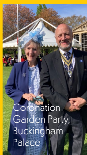
Coronation Garden Party, Buckingham Palace