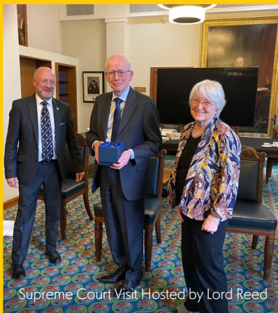
Supreme Court Visit Hosted by Lord Reed