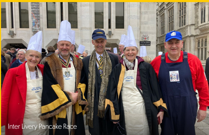
Inter Livery Pancake Race