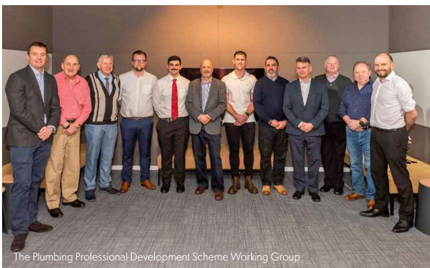
The Plumbing Professional Development Scheme Working Group

We also took the opportunity to create video clips at the Installers Show. Extensive filming took place of key moments in the hall (award winner etc) and through interviews. The outcomes are short accessible clips on 'Women in the Livery', 'Why Join', 'Corporate Membership', 'Awards and Bursaries', 'PPDS'. They can be viewed on the website and add to our communications and recruitment toolkit.