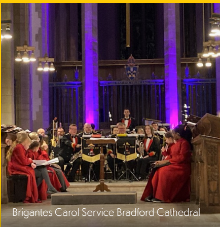
Brigantes Carol Service Bradford Cathedral