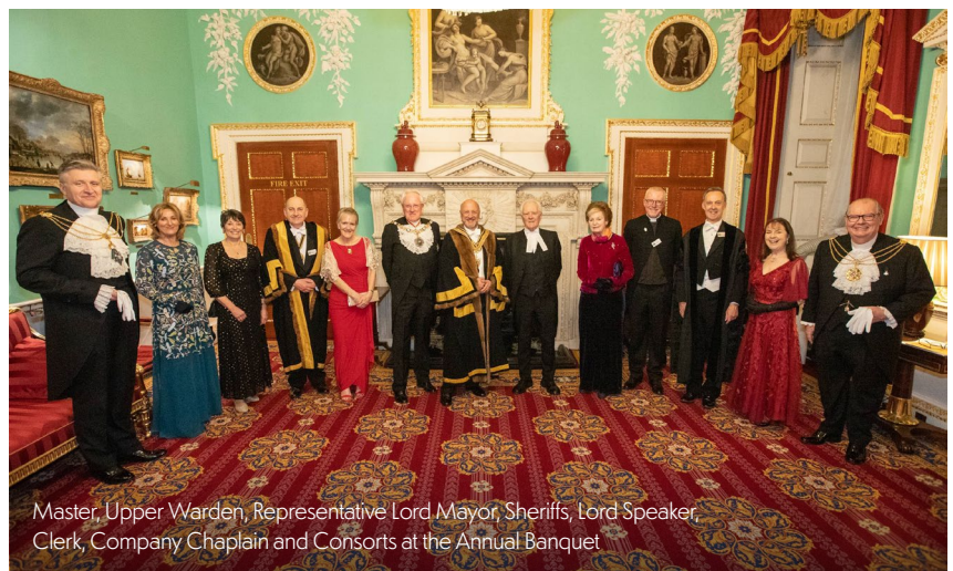
Master, Upper Warden, Representative Lord Mayor, Sheriffs, Lord Speaker, Clerk, Company Chaplain and Consorts at the Annual Banquet