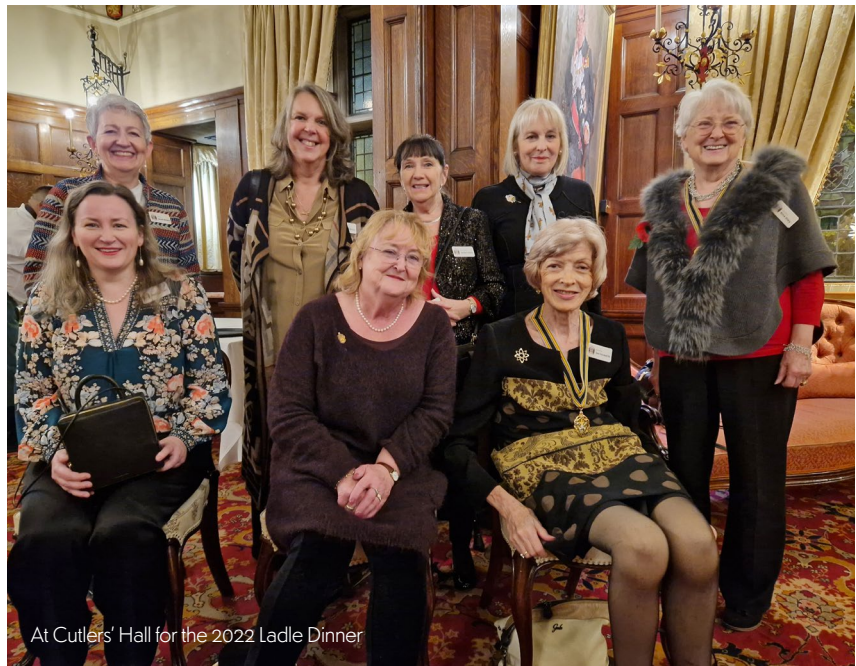
At Cutlers' Hall for the 2022 Ladle Dinner