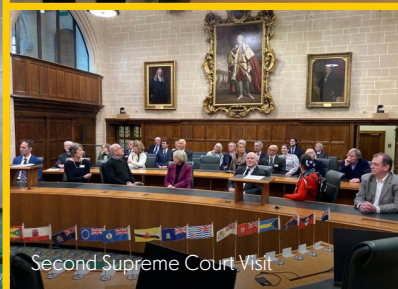
Second Supreme Court Visit