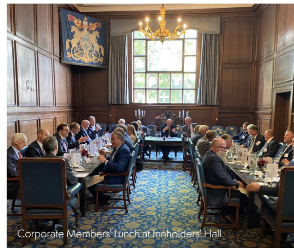
Corporate Members' Lunch at Innholders' Hall

We are also looking at how we retain members, at a time when people are feeling the financial squeeze. The Social Induction evening was run in September with 12 attending. Recent joiners talked about their experience of the Plumbers so far, and what would make it even better. Another well received initiative is the Integration (hosting) Scheme where an experienced liveryman looks after a recent joiner at a Plumbers' event — we've done this 39 times in the last 2 years.