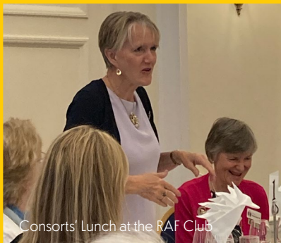
Consorts' Lunch at the RAF Club