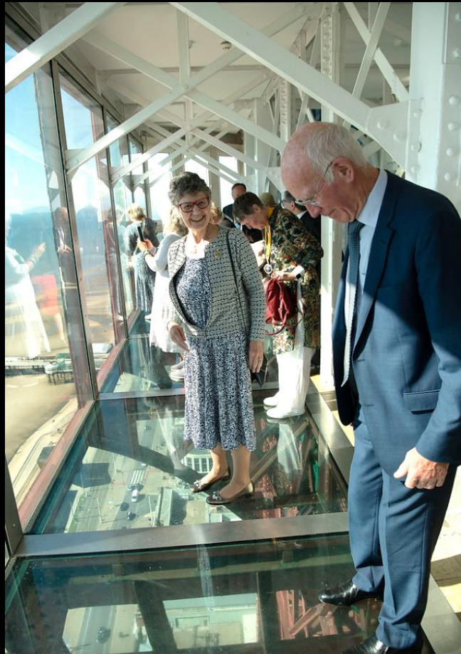
The famous glass floor – not for the faint hearted