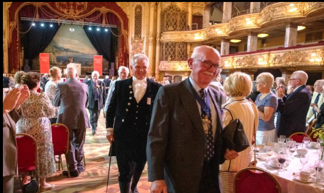
Beating the Retreat