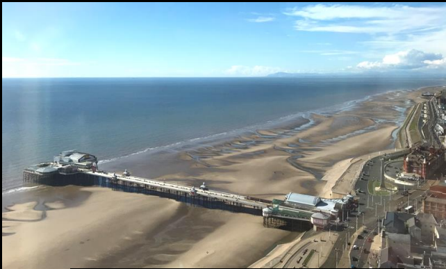
North across Morecambe Bay to the Lake District