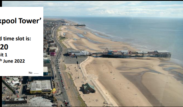
South to the Welsh Coast and Snowdonia

'Trip up Blackpool Tower' Your scheduled time slot is: 17.20 Admit 1 Thursday 30 th June 2022